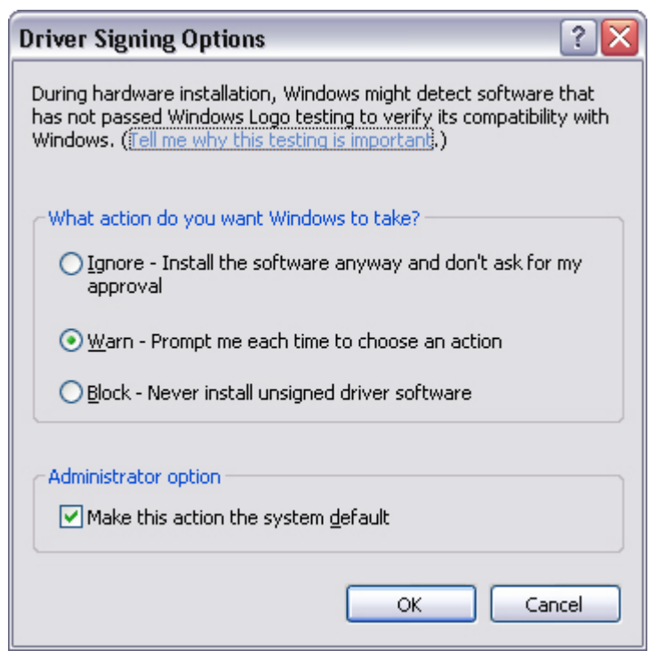
Windows Driver Signing Options dialog

Click on the Hardware Tab, then click on Driver Signing. The Driver Signing Options dialog opens: